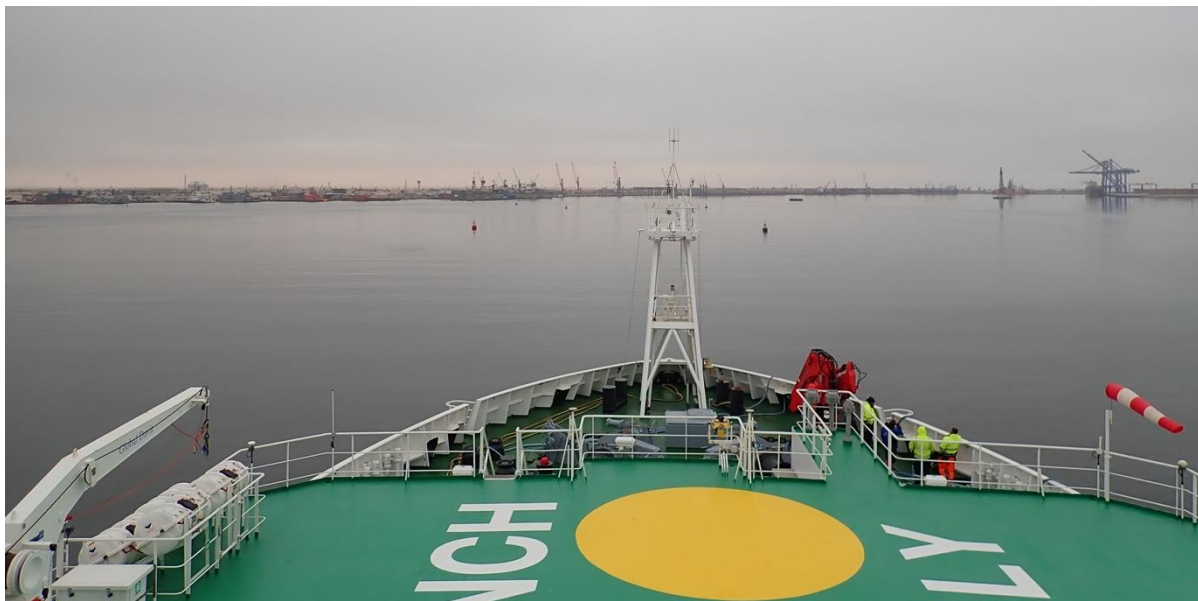
Figure 1: Walvis Bay in coastal fog

After more than three weeks of intensive station work with 154 stations in total and 440 instrument deployments, our measurement mission in the Benguela upwelling system already ended on Sunday, October 10 th , with the arrival of RV SONNE in Walvis Bay. Thus, this week was dominated by the wrap-up of the last stations and clean-up, as well as a look back at the last day of our field work. On this day, Luisa Meiritz and the crew recovered and re-deployed our long-term sediment trap system. It is located in an area specially reserved for research near the entrance of the Walvis Bay harbor. To avoid conflicts with fishermen, this area is officially marked on the nautical charts. The special feature of this position is its proximity to the coast, which allows us to study the impact of the land on the marine ecosystem.