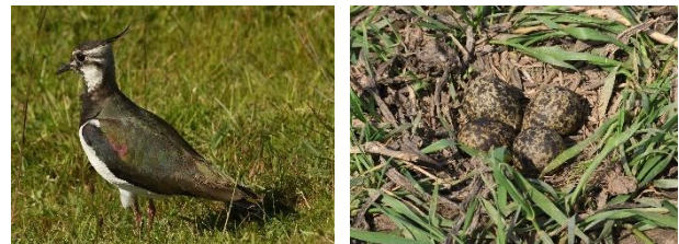
Lapwing and lapwing clutch in a grain field