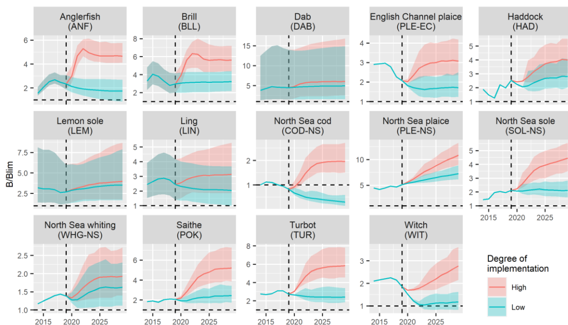
Figure 1: Spawning stock biomass (B) relative to limit biomass (Blim) per stock and scenario. Median values (colored lines) and uncertainty ranges (shaded areas; 5% and 95% percentiles) from 100 model runs are shown. The start of the simulations (2019) and the reference line B/B_{lim} = 1.0 are shown as dashed lines. Scenarios differ in the degree of implementation of the landing obligation ("High" – strict implementation: fleets stop fishing once the first quota is exploited; "Low" – low degree of implementation: fishing does not stop when the first quota is exploited, but continues until the fishing effort from the previous year is reached). Source: adapted from ProByFish Final Report (2021).

Further details can be found in the ProByFish Final Report (2021).