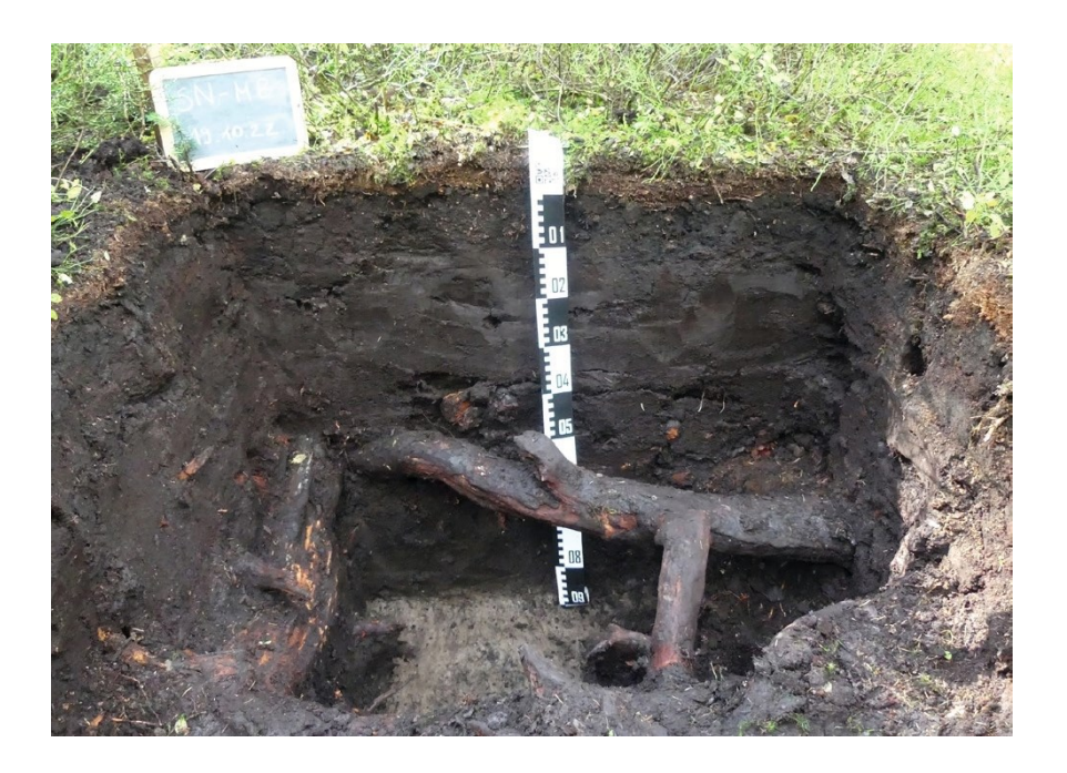
Figure 7 Drained Histosol (Sapric Murshic Histosol (Dystric)) with tree-root remains in the Ore Mountains.

The proportion of Histosols (i.e., peat soils) and other humus-rich wet soils in the soil cover under forest is approximately 2.4 %. The major part of the peatland and wet soils has been subject to artificial drainage. Even though Histosols make up only a small area, they act as an important carbon storage, and as a relevant CO<sub>2</sub> source in case of drainage. Their rewetting offers potential for climate-change mitigation and biodiversity conservation.