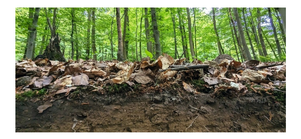
Figure 8 The forest floor and intensively rooted topsoil: the place where organic matter is transformed, most of the soil organisms live and where nutrients are recycled.

The National Forest Soil Inventory (NFSI) provides information about the current state and the changes of our forest soils. For this purpose, soil, forest-stand and vegetation data are collected on 8 km x 8 km grids at 1,900 sites across Germany. The NFSI takes place approximately every 15 years. The field assessments of the third NFSI are currently in progress.