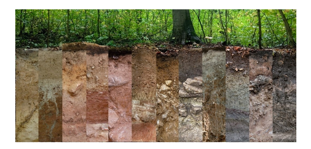
Figure 5 Diverse appearance of forest soils. Factors controlling soil formation, properties and functionality include bedrock, climate, flora and fauna, as well as human influence and the duration of soil formation.

Different from what the term "forest soil" might suggest, there is not one forest soil. In contrast, a great variety of soil types with diverse properties and appearance is found underneath our forests.