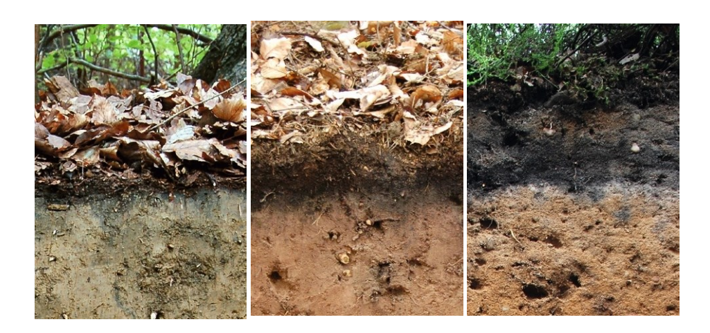
Figure 4 Three typical forest soils with their characteristic humus forms, from left to right: Luvisol with mull, Cambisol with moder, Podzol with mor.

When leaves, needles and twigs fall onto the forest floor as litter, they form a humus layer together with other organic remains. Depending on the ecological site conditions, different humus forms, such as mull, moder or mor, develop over time. The actual humus form points to the magnitude of biological activity and nutrient turnover, as well as to the nutrient availability in the topsoil. The humus form that develops at a certain site, depends on the temperature, water availability, aeration, nutrient supply, litter composition and the activity of the soil organisms.