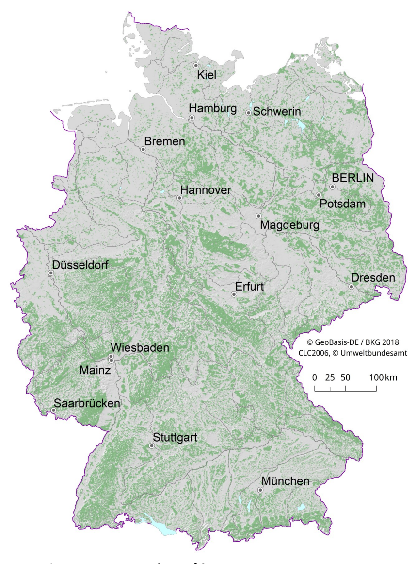
Figure 1 Forest covered area of Germany.

Almost one third of the area of Germany (11.4 million hectares) is covered by forest. Thus, forest soils play an important role in our landscape, providing fundamental functions and ecosystem services to forests and their water and nutrient cycles.