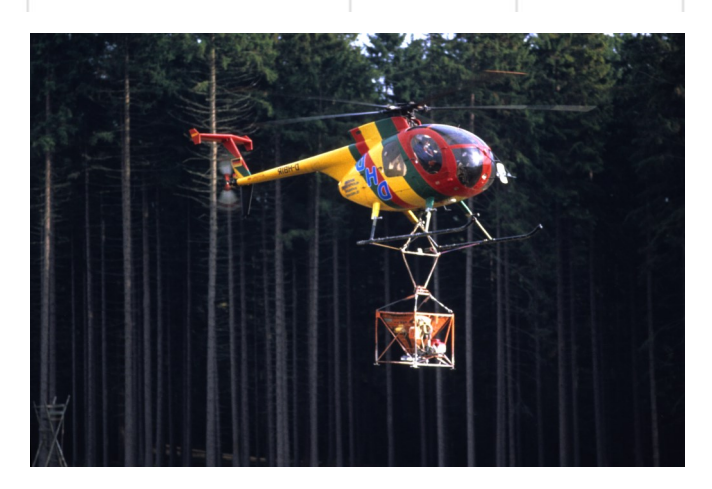
Figure 10 Soil protective liming by helicopter, © Geological Survey North-Rhine Westphalia.