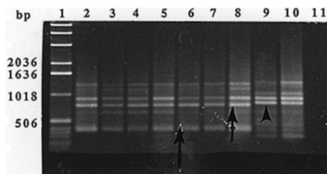
Fig. 2. – RAPD amplification patterns with primer P-9. a) Lane 1 contains 1-kbp DNA ladder, lanes 2-8 contain amplified products from individual jack pine ( Pinus banksiana ) trees from different sites in Sudbury; lane 9 contains amplified products from red pines ( P. resinosa ) used as reference. Arrows indicate RAPD markers specific to jack pine and arrowhead shows a RAPD marker specific to red pine. Note the low level of RAPD variation among jack pine samples.

The genetic distance scale runs from 0 (identical) to 1 (different for all criteria). The genetic distance estimates are summarized in table 3. In the present study, the genetic distance values varied from 0.02 to 0.71 (Table 3). Populations from sites 5 and 6 around INCO smelters were very similar. Trees from INCO tailing (site 7) and Control site Cartier (site 10), were also genetically close. Populations from site 1 around Falconbridge smelter and population from site 5 around INCO smelter were genetically distant.