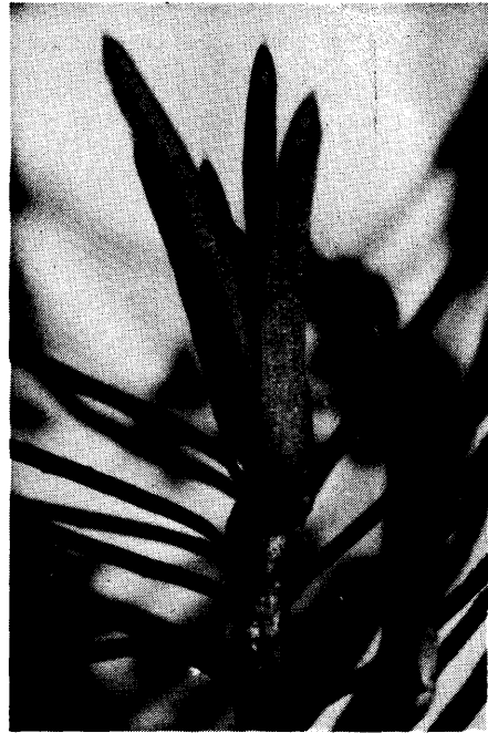
Figure 2. — Elongating scion deriving from a side-grafted meristem after the rootstock epicotyl had been cut back just above the graft point.